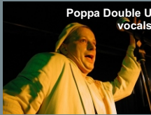
Poppa Double U vocals